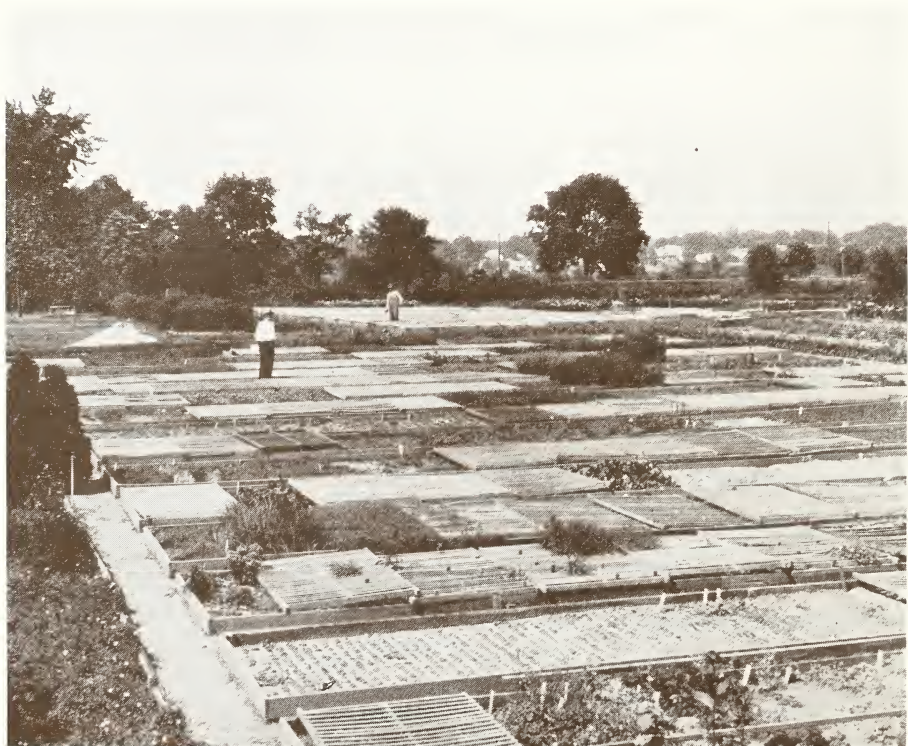
View of Rock Garden Plants